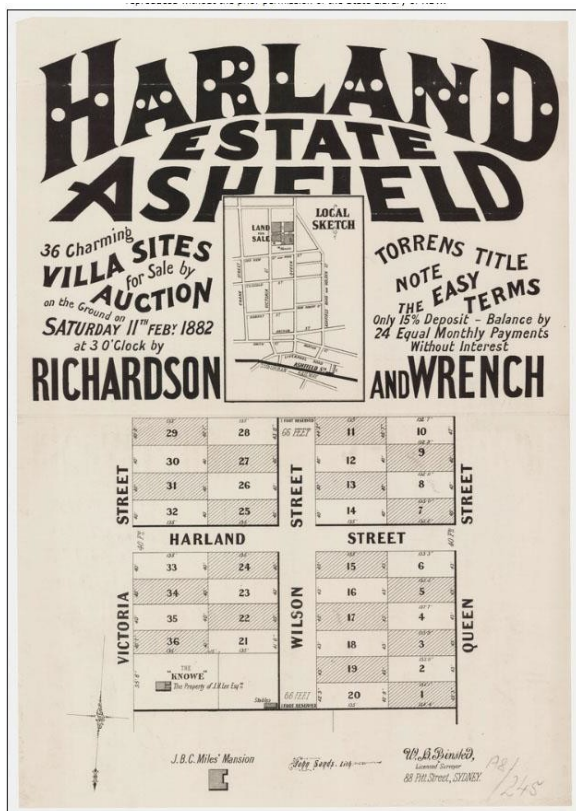
Above left: Harland Estate subdivision map of February 1882